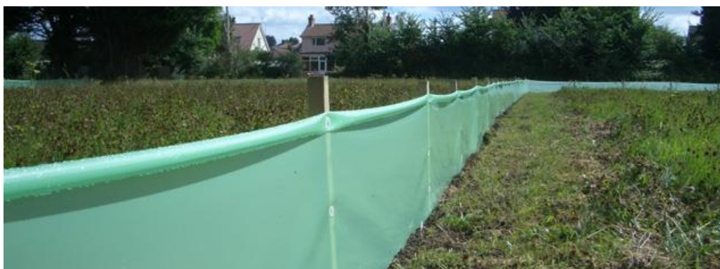
A typical Newt Fence

A newt fence is approximately 0.5m high and consists of an impermeable membrane approximately 1mm thick the bottom edge of which is entrenched to form an impenetrable barrier.