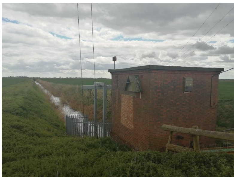
Photos 1 (L) a typical Euximoor drain 2 (R) Reed Fen Pumping Station with barn owl and bat box