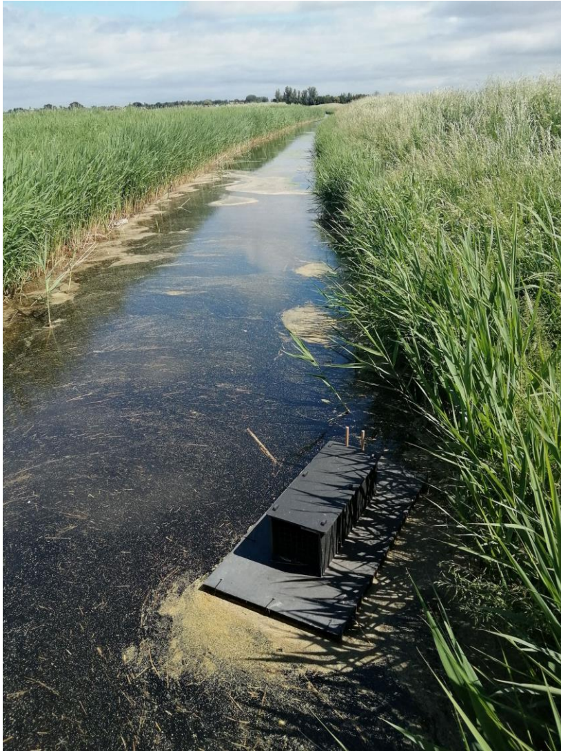
Figure 1 Board funded mink raft on a Manea & Welney DDC drain. The district's drains support important water vole populations which benefit from the maintenance regime creating substantial margins of fresh reed growth.